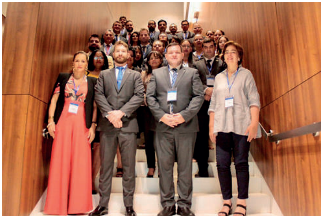
Participants of the "Technical Workshop on Climate Change" held by COMTEMA in Asuncion, Paraguay, December 5-7, 2022.

From December 5 to 7, COMTEMA held in Asuncion the "Technical Workshop on Climate Change", coordinated by the TCU (presidency) with the support of the CGR of Paraguay and GIZ, within the framework of the Project "Strengthening External Control in the Environmental Area".