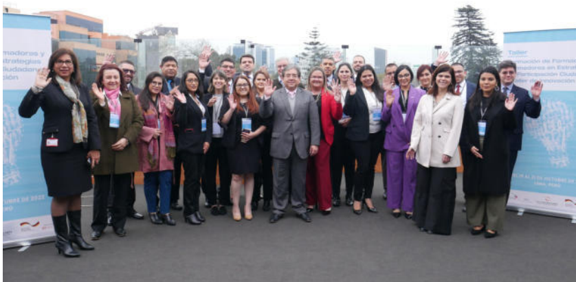
Official photograph of the Second Edition of the Training Course for Trainers in Citizen Participation Strategies and Innovation Workshop.

The OLACEFS Citizen Participation Commission carried out the second edition of the Training Course for Trainers in Citizen Participation Strategies, which was conducted in a blended learning format. Thus, the virtual phase was held from August 25 to September 29, 2022, while the face-to-face phase was held on October 19 and 21, 2022, in the city of Lima, Peru, with the additional development of an Innovation Workshop on Citizen Participation Strategies, in order to complement the knowledge of the participants, with the support of GIZ.