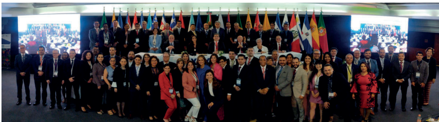
Group photo of the XXXI Ordinary General Assembly of OLACEFS held in Oaxaca de Juárez, Mexico.

“Generating public value with good auditing practices”