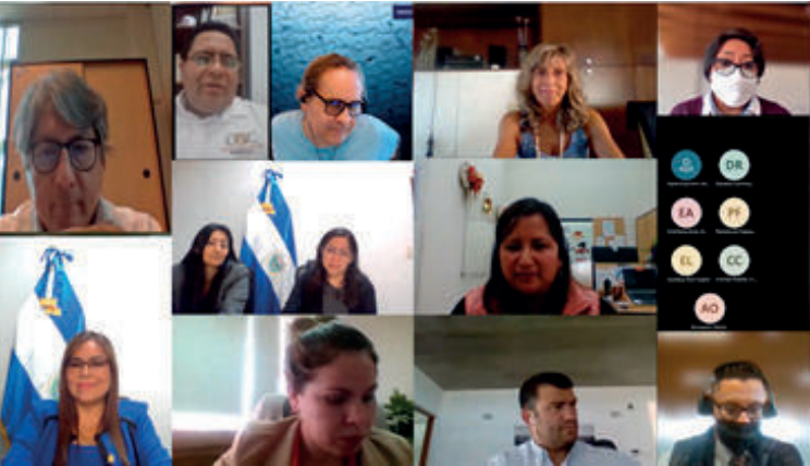
SAIs of Brazil, Bolivia, Colombia, El Salvador, Ecuador, Guatemala, Peru, Mexico and the HTC Province of Buenos Aires.