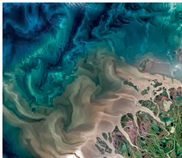
Mackenzie River in Canada as seen from space

The CCC is at your disposal for further information about this initiative or about the training of Geotechnology Specialists, through the e-mail ccc@tcu.gov.br .