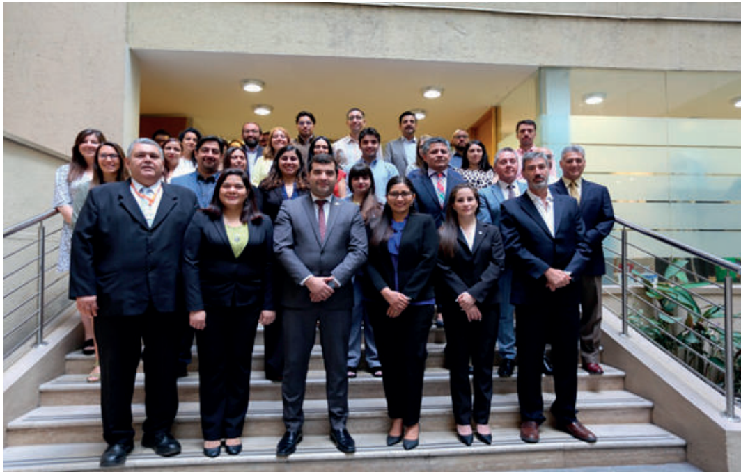
Participants of the EFSUR Coordinated Audit Workshop on SDG6 held in Santiago, Chile.

The Workshop on Monitoring and Supervision in the Execution, Presentation of Partial Results and Good Practices of the Coordinated Audit of EFSUR to SDG 6 was held in Santiago de Chile on December 12, 13 and 14. The workshop was held in person, with transmission via Teams, with the participation of delegates from the SAI members of the coordinated audit, from Argentina, Chile, Ecuador, Paraguay, Peru and Venezuela.