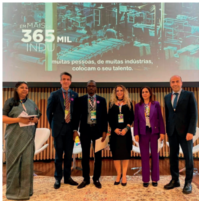
Panelists at the International Forum on Government Auditing.

To close her presentation, the Argentinean Auditor stressed the challenge of making audits visible and following up on recommendations; and proposed incorporating gender mainstreaming in SDG audits.