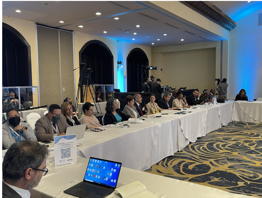
OLACEFS representatives participate in sessions of the Public Integrity Network for LAC.

Innovation in public integrity policies for better management control is one of the pending challenges in Latin America and the Caribbean. This challenge for an effective implementation of preventive and anti-corruption policies also entails the need to look at the political economy of reform and changes in organizational culture.