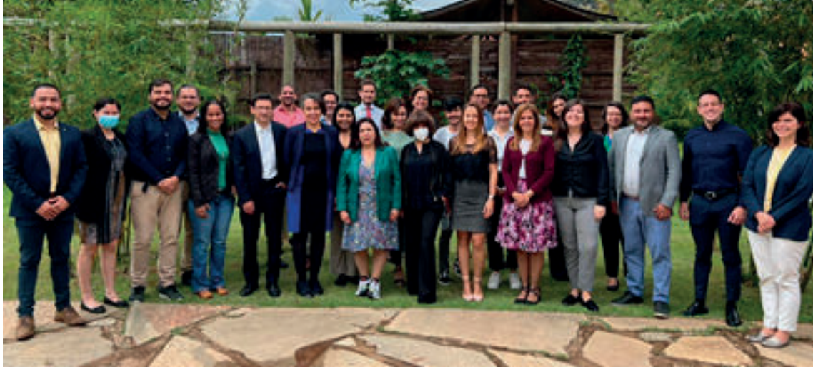
Participants of the face-to-face workshop of the Regional Project "Strengthening External Control for the Prevention and Effective Fight against Corruption" - GIZ / OLACEFS, Brasilia, December 2, 2022.

At the LXXV Meeting of the Governing Board of OLACEFS, held on September 20, 2022, in Oaxaca City, Mexico, the creation of the Working Group on Auditing Infrastructure Policies and Regulation (GTINFRA) was approved, as proposed by the Federal Court of Accounts (TCU) of Brazil. The activities of this Working Group include, among others, coordinated audits of infrastructure policies, plans and actions, maturity of institutions, as well as infrastructure studies and projects, business environment, and the permanent promotion of training of Supreme Audit Institutions (SAIs).