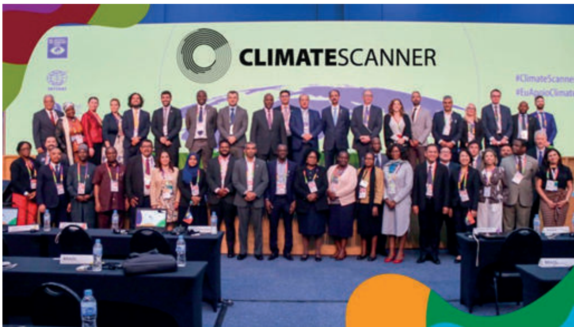
Launch of the "ClimateScanner" initiative at the XXIV INCOSAI, Rio de Janeiro, Brazil.

The "ClimateScanner" platform, which will enable a global audit of government actions related to the fight against the climate crisis, was officially launched on November 10, 2022, during the XXIV International Congress of Supreme Audit Institutions (INCOSAI), in Rio de Janeiro, Brazil. The Federal Court of Accounts (TCU) of Brazil, which chairs the International Organization of Supreme Audit Institutions (INTOSAI) and is part of the organization's Working Group on Environmental Auditing, is leading the development of this tool.