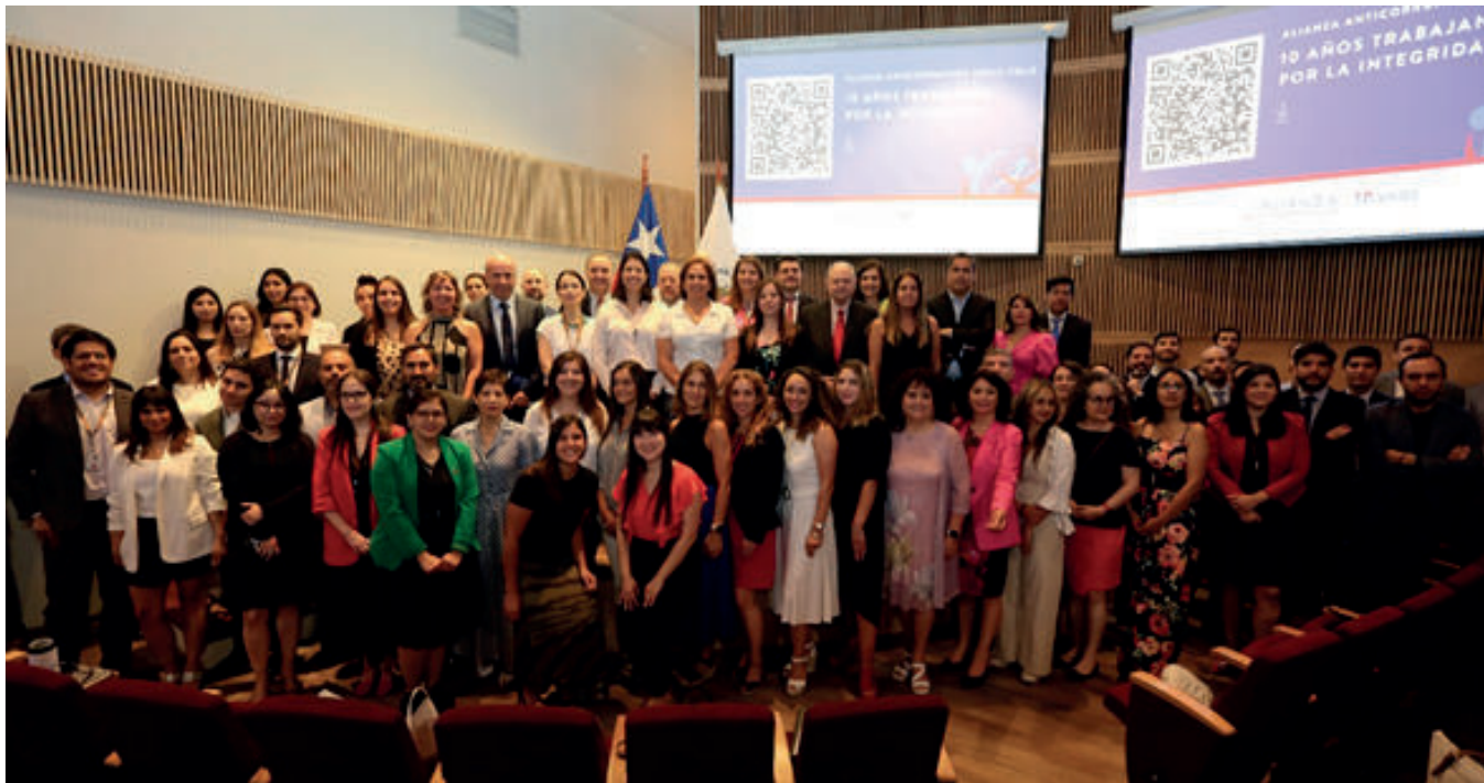
Event commemorating the tenth anniversary of the UNCAC Chile Anti-Corruption Alliance.

On Tuesday, December 13, the tenth anniversary of the UNCAC Chile Anti-Corruption Alliance was commemorated in Santiago, Chile. The event consisted of a presentation of the institutional report entitled "10 years working for integrity" and the special edition of the Chilean Journal of State Administration on the fight against corruption. Afterwards, authorities and participants attended a fair open to the public entitled "Protect Integrity".