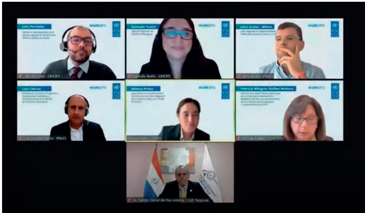
Panelists at the Regional Virtual Forum on Preventive Auditing.

The event was organized by UNOPS and UNDP - within the framework of the Thematic Coalition on Governance and Institutions of the Regional Collaboration Platform. The objective of the forum was to strengthen partnerships with audit institutions in the region, considering their relevance for the transparent, efficient and responsible execution of public funds and their work for proper accountability.